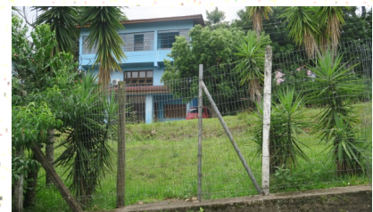
The current fence to be replaced

CHAIN OF LOVE HOMES, CP 2040, NOVO HAMBURGO, RS 93.511-970, BRAZIL chainoflovehomes@gmail.com www.larcolmeia.com.br