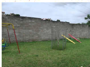
The big wall on one side...

We still have a big challenge ahead. We are planning to install a stronger metallic fence on one side of our property (the other side has a big wall protecting the campus). The current fence is not very strong and one of the burglaries likely took place on that side of our campus. We estimate that US$23,000 or CND$28,300 will be enough for us to build a new fence and protect the campus in an even more effective way. If you wish to contribute to this project, any amount of money is welcome. If you are not able to help financially, your prayers are much appreciated. Thank you!